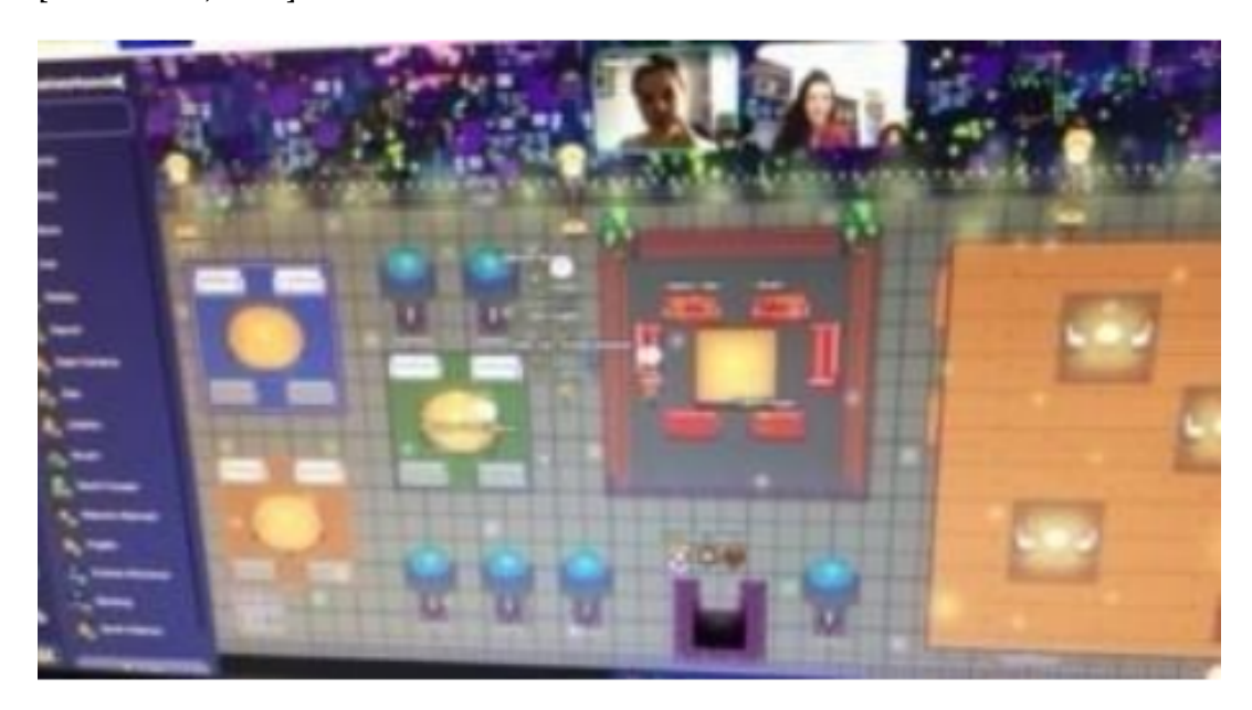
Figure 2. Screenshot of Gathertown during social session of 'Have you fed the cat?' workshop.