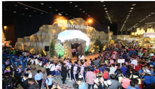
Figure 5 . Examples of thematic exhibitions displayed at NSTF 2014.

The second strategy is that in order to attract young people and teenagers and to promote the image of science is for everyone, two famous young actors are invited to be the fair Presenters each year shown is Figure 6. They both act as ambassadors of the fair within all public relations (PR) materials, marketing campaigns and press conferences. They also visit the fair from time to time and talk to visitors showing that they can do and play with science as well. The presenters are seen to join all activities themselves such as the Free Fall or Science Lab. This also helps to introduce special areas in the event such as The Animatronics Exhibition, Science for Kindergarten or Science Library for example. This second strategy greatly draws the interest of young people and promotes a new perception that science can be for anyone.