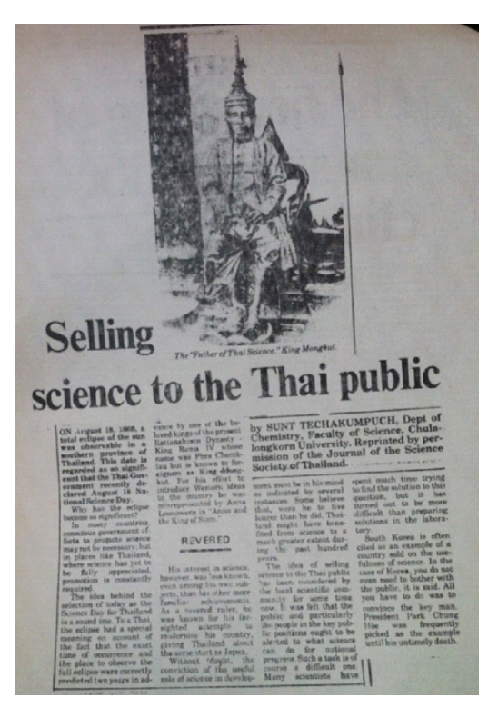
Figure 1 . Hand-made brochure of the first Thailand National Science Fair in 1982 and the news from the event.

it was written into the national policy, with an aim to inspire interest in science within the public. The Ministry of Science and Technology was assigned to act as the organizing body to work in co-ordination with various agencies to organize the fair (to see the development see Figure 3).