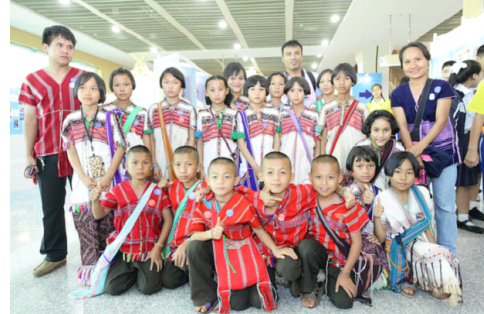
Figure 8 . NSTF 2014 at Chiang Mai International Convention and Exhibition Center and the smiles of our visitors of an ethnic northern group.