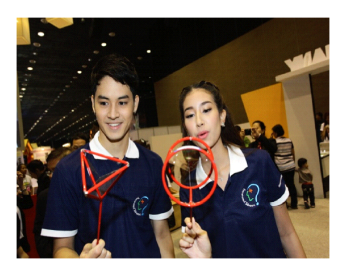
Figure 6. Youth idols as presenters of NSTF 2014.

to insist that their parents bring them back again. Originally uninterested parents thus have a chance to visit the fair for the first time and get an opportunity to experience the fun and excitement of science at the fair. The returning visitors not only bring their parents but also their brothers and sisters and sometimes grandparents or other adult relatives to the fair. Our observations show that teen visitors revisit the fair during the weekend with their friends to enjoy the excitement of special exhibitions and also to get a chance to see the famous presenters at the fair.