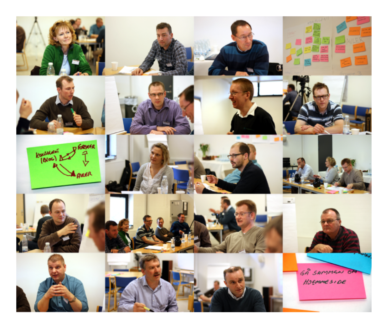
Figure 2. Moments from the workshop showing the participants taking full part in the lively discussions.