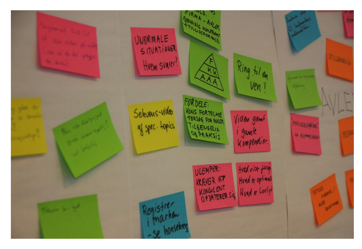
Figure 3. Collection of post-its from the workshop. In the current view are post-its from scientists, consultants, and growers.

third round of analysis the 100 codes were investigated and narrowed down to 20 overall codes reducing overlaps and redundant coding. The transcribed data were then reanalyzed using the 20 codes to see if they covered all aspects or not. When satisfied, we continued collapsing the codes into six overall themes. Theming the codes was carried out in a manner similarly to the third round process aggregating the codes into six themes or categories. See table 1 for details. These six themes would turn out to be topics that were especially discussed among the participants.