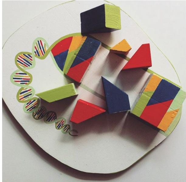
Figure 1. The DNA puzzle of the OL.