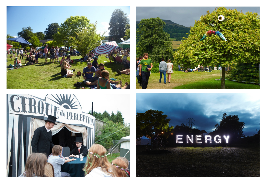
Figure 4 . Communicating key messages of fun and playfulness to the audience: brightly coloured parasols, moustaches in trees, scientists in top hats and tail coats and a pedal power installation.

of the space enables visual communication with the audience and the transmission of key messages and invitations to festival-goers that are easily understood. Brightly coloured bunting and parasols communicate that the space is fun and relaxing, whilst large sculptures of eyes and moustaches hung in trees make Einstein-inspired 'tree faces' that tell the audience that the space does not take itself too seriously. Scientists wear everyday clothes or intriguing costumes (not lab coats!), making them approachable and avoiding stereotypes, whilst participatory installations invite the audience to join in and play (Figure 4).