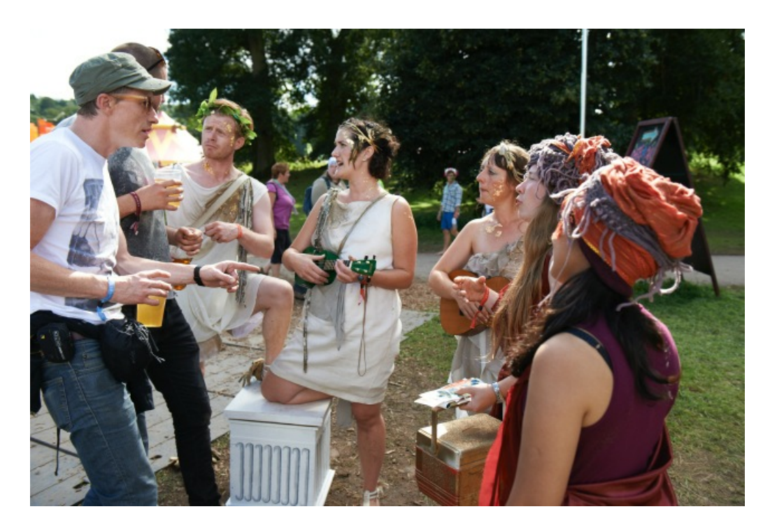
Figure 3 . Festival-goers, performers and scientists engaging together in the project Hormone Harmony.

Impacts on continued involvement in public engagement with science were incredibly encouraging. Specific examples included the Einstein's Garden experience used as: a 'springboard' to seek involvement in other projects, opportunities and funding; a case study to 'open doors' and inspire new collaborations; a way to legitimise and motivate further projects and in one case the establishment of a specific outreach programme.