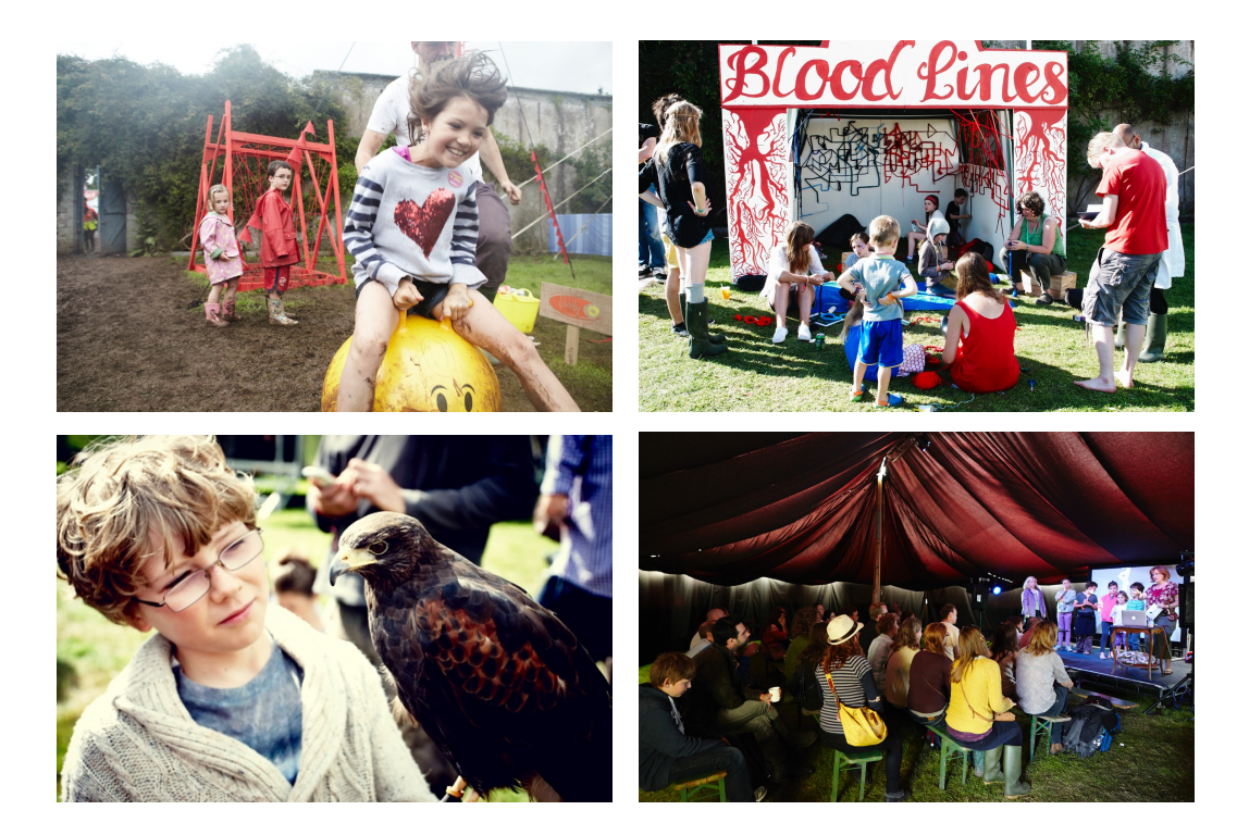
Figure 5 . Examples of diverse content in Einstein's Garden: a 'hydrogen fuel cell' game, a knitting installation inspired by the vascular system, falconry and a talk in the Omni-Tent.

"... the objectives of the festival organizers should be to design a program that offers freedom to sample and choose a variety of performances and activities, consistent with the overall theme and values. It is this richness and choice that distinguishes a festival from a single concert performance."