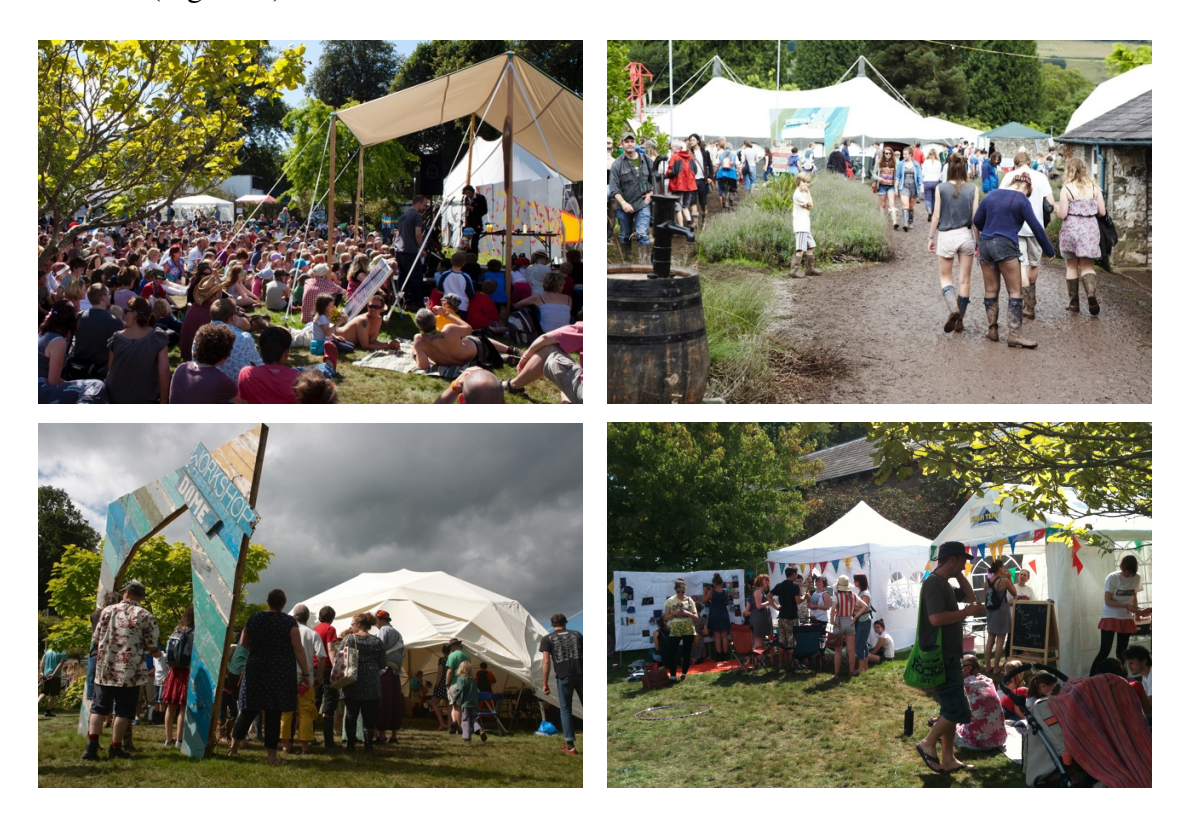
Figure 1. Views of Einstein's Garden: Solar Stage, Omni-Tent, Workshop Dome and Science Stalls.

Located in the rose garden of Glanusk Park, Einstein's Garden is a cluster of three grassy spaces divided by trees, flowerbeds, stone walls and bordered by a stream. Three venues provide the focus for each space; the Solar Stage, the Omni-Tent and the Workshop Dome and each is edged with 'Science Stalls' delivered by universities and learned societies (Figure 1).