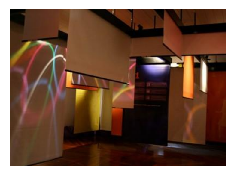
Figure 2. Labyrinth/party at Preventing Youth Pregnancy.