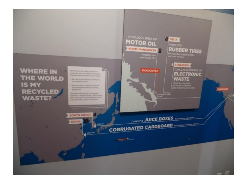
Figure 5. In this map/infographic, visitors can critically consider where Metro Vancouver companies send waste to be recycled.

One of the things I am always nervous about is... I do not want to go and... rant at a visitor and say... 'well you should be doing this and you should be doing that' because it is going to have the opposite effect on them and they are not going to feel [well]... Things like asking people to change their diet, remove red meat from it... some people would passionately say 'no, I do not want to do that'... So, I feel... the way that it [the exhibit] presents it is like 'here is some information and you can do what you want with it'. (Interview, Museum mediator)