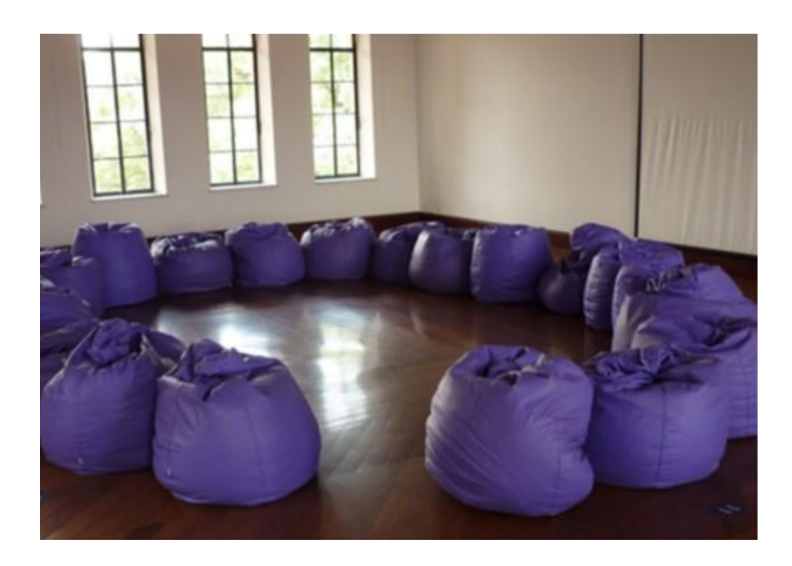
Figure 1 . Conversational space at Preventing Youth Pregnancy .

Once the party is over, visitors encounter a different scenario. The labyrinth is removed, music is turned off, and they are invited to sit again in the puff chairs