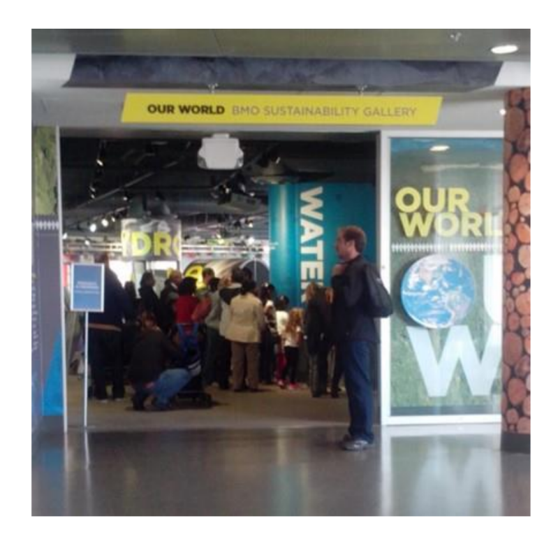
Figure 3. Entrance of Our World.

displays, without following a suggested pathway. For example, they can stop at a dialogue box that invites them to answer a daily question involving consumption options. They can also come across maps that highlight waste pathways departing from Canada, and large-size striking photos (projected on the walls) related to the impact of pollution and waste on different living beings and environments. At Our World visitors can also find containers full of unrecyclable materials, interactives about water use/consumption, and games about compost [Navas Iannini & Pedretti, 2022]. The exhibit has mediators in the space available, if needed, for clarifications of the exhibit's narratives and/or explanations about how to interact with certain displays.