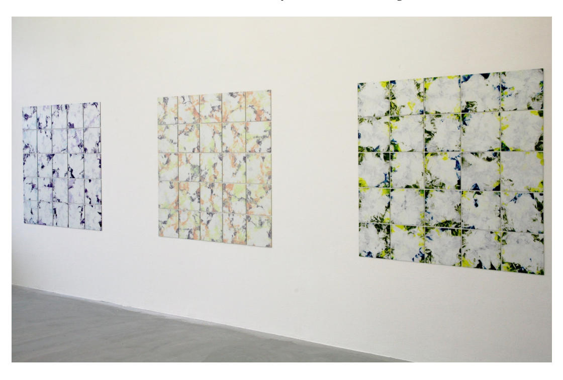
Figure 3 . Schümeyer (Hagen Schümann, Felix Meyer Wolters), "Komp. 1–10", 2014 (Installation view HFBK Hamburg).

various features, like Darwinism, randomness, chaos, evolution, and subjective selection which can be transferred to many science tasks (Figure 3).