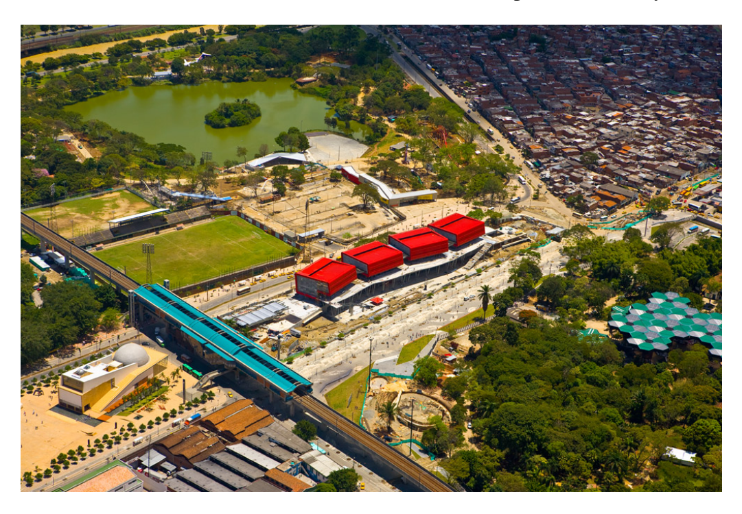
Figure 3. Parque Explora. In the upper right, the Moravia sector.

Parque Explora is a Science Center created for the appropriation and popularization of science and technology. It was conceived as part of the city's development program. Located in Moravia, in the northeast of Medellin, it is surrounded by the main Regional University, the Botanical Garden, an amusement park and a public square mostly visited by students and neighbors. This cultural pole has been conceived as an urban integrated space, aimed at the educational, cultural and touristic development of the city.