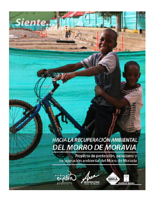
Figure 1. Poster of the project.

Usually science centers are seen as places to communicate science in a fun way; to engage citizens in scientific or technological discussions related with their lives; to support and accompany school processes in K-12; even to promote vocations for the allegedly declining science and engineering higher education programs. There is an image of these institutions very focused on the mise en scène of content and methodologies associated with the world of the natural sciences. However, in recent times, expressions like "public engagement", "social appropriation of science", "citizenship education", and "social inclusion" are increasingly evoked in these institutions, which reflects a major transformation of the science center role and a new involvement within the education and transformation processes taking place in the society they are engaged with.