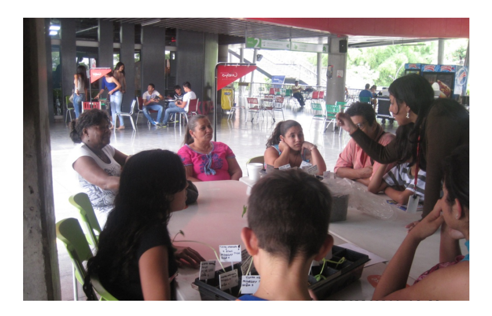
Figure 8. Workshop in Explora. Acid such as lemon, basic as soap.

Do you now dare to cook a salad with slices of tires and batteries?