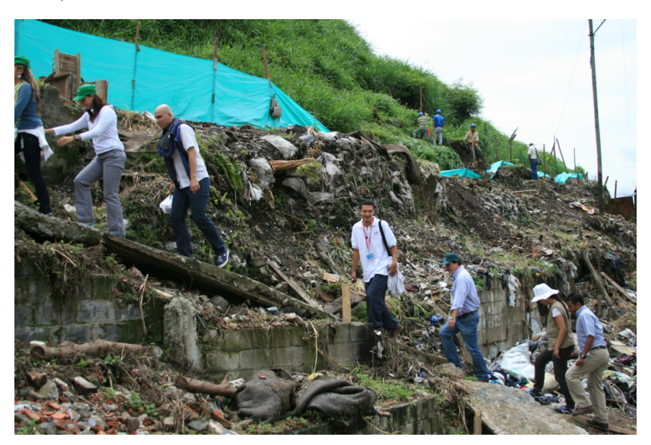
Figure 6. El Morro de Moravia.

The environmental control agency of the Valley (Área Metropolitana del Valle de Aburrá -AMVA-), The office of the City Hall for Moravia, and Parque Explora joined forces to support the social and communication processes of environmental recovery of El Morro (Moravia Hill).