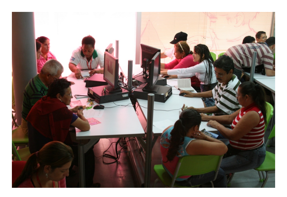
Figure 4. Workshops in Explora with its Moravia neighbors. AMVA Project.

A social management policy has been estabilished, based upon four pillars that serve as a conceptual basis for the performance of intervention exercises. It strengthens the science center as an open space of the city for permanent dialogues and in tune with the urban transformations and dynamics.