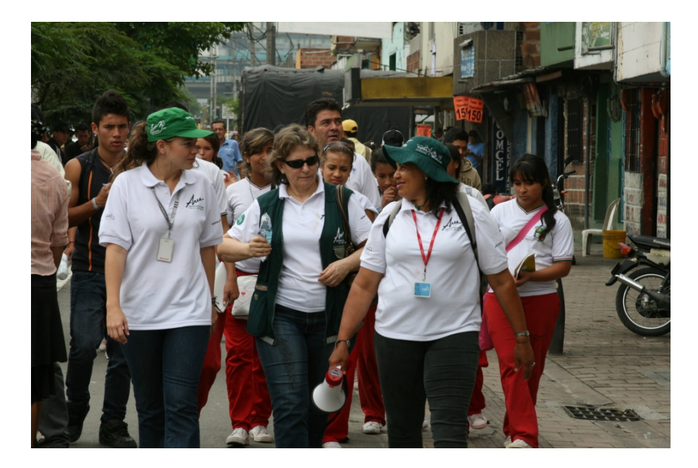
Figure 11. Route by Moravia. 2011.

Some reflections that resulted from this project, and are still considered in Parque Explora for future formulations of social appropriation of knowledge projects, are: