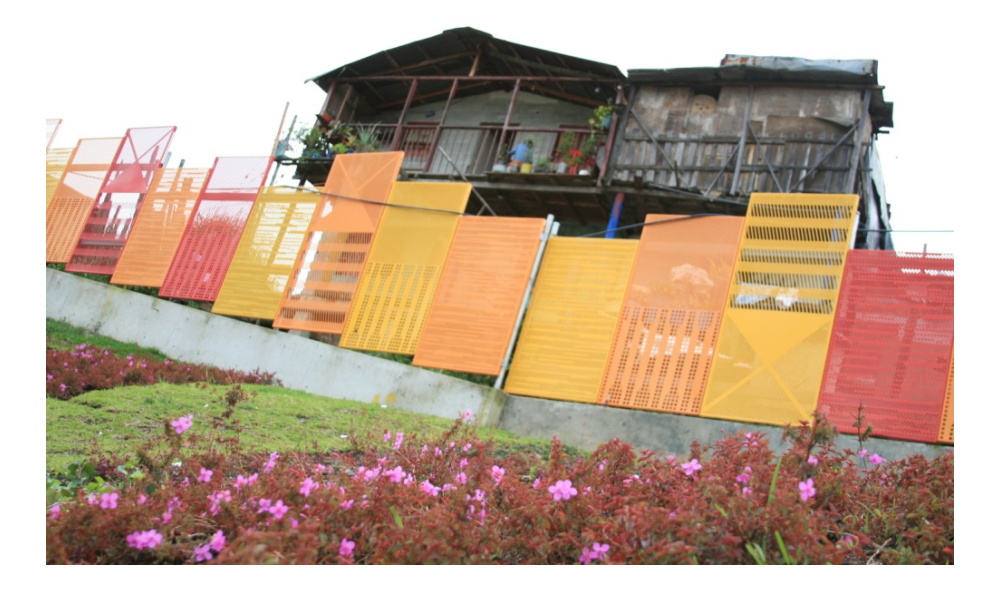
Figure 7. Part of the landscape recovery of the Morro.

With the joint work of the entities involved in the project two fundamental parts were developed: one concerning the Education and Participatory Management of the project and the other related to the Dissemination and Positioning of the project among different public, private and community actors. The aim was to generate environmental, educational and cultural fallout from the inhabitants of the area of influence of the project over the inhabitants of the rest of Medellin.