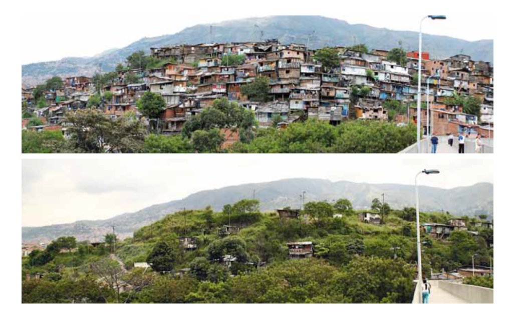
Figure 2 . Comparison of the brow of the hill of garbage 2004 (above)–2011 (below). A. Unknown/© Daniel Viadé [8].

According to the census of 2004 made for the "Project of Integrated Intervention in Moravia and its area of influence", 2,654 families were living in 10 acres of lands.<sup>2</sup> This mountain, 35 meters high, was totally made up by 1.5 million tons of garbage [8]. Soil instability, steep slopes, fragile constructions, the presence of industrial, clinical and domestic waste and the continuous release of toxic gases and leachate, made the inhabitants of Moravia subject to high chemical and microbiological risks. In 2006 it was declared a public calamity by the Ministry of Interior and Justice.<sup>3</sup>