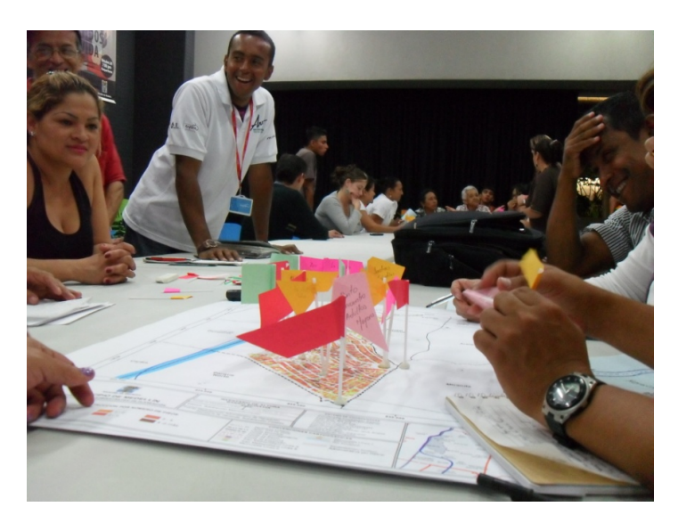
Figure 9. Cartography workshop in Explora. AMVA Project.

Thanks to the workshops and training, the leaders recognized the environmental, social and landscape characteristics of the process taking place in Moravia through institutions, and could replicate them. The leaders were gathered through various community organizations, selected on the basis of their experience in community management. Their communication, ethnographic and project development skills were reinforced through specific trainings.